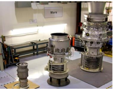
Saturn, Taurus, Mars Turbines Engine Exchanges