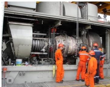
On-Site Training Available