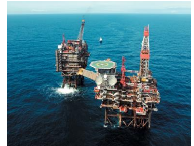
Prevent Costly Asset Failures

EthosEnergy is an Independent Service Provider (ISP) for value-add rotating equipment services and solutions to the power, oil & gas, and industrial markets. Globally, these services include facility Operations & Maintenance; design, manufacture and application of engineered components, upgrades and re-rates; repair, overhaul and optimisation of gas turbines and steam turbines, generators, compressors.